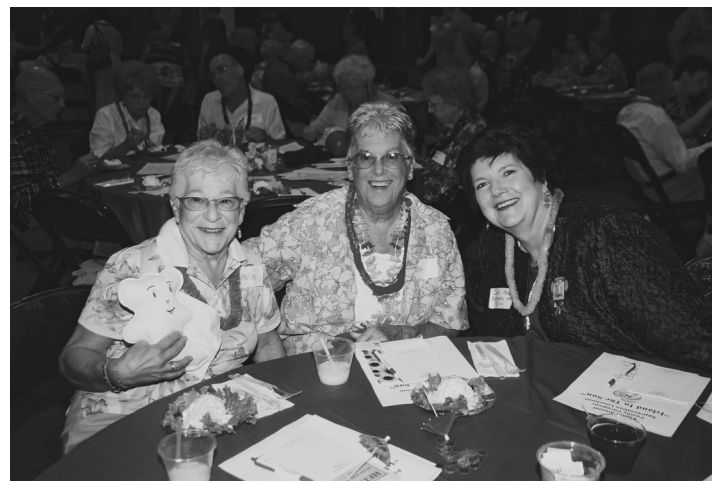
Attendees at the Eighth Annual Family Caregiver Appreciation Luncheon

The theme, "Island in the Sun," was chosen so these caregivers, who often do not get a "break" from their daily routine, could have the opportunity to enjoy themselves in a "tropical island paradise," not far from their own homes.