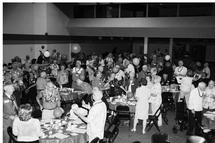
Attendees bounced balloons in the air.

We thank all those who participated, both as sponsors, and volunteers, in showing appreciation for family caregivers.