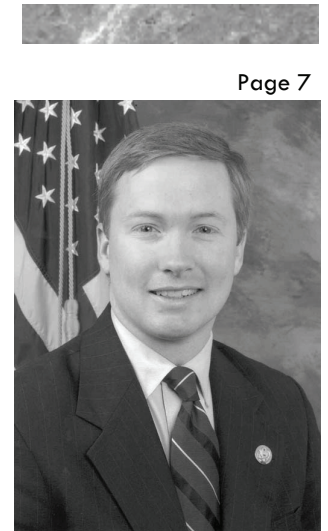
Congressman Adam H. Putnam

The Long-term Care Retirement and Security Act of 2008 would establish income tax deductions for eligible long-term care insurance premiums for a taxpayer and the taxpayer's spouse and dependents; and a credit for eligible caregivers caring for certain individuals with long-term care needs. It would also establish consumer protections based on the National Association of Insurance Commissioners recommendations for qualified long-term care policies.